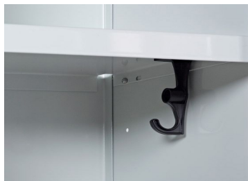
Top shelf and coat hook fitted in single compartment